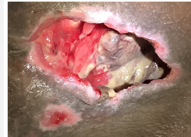
After 7 days