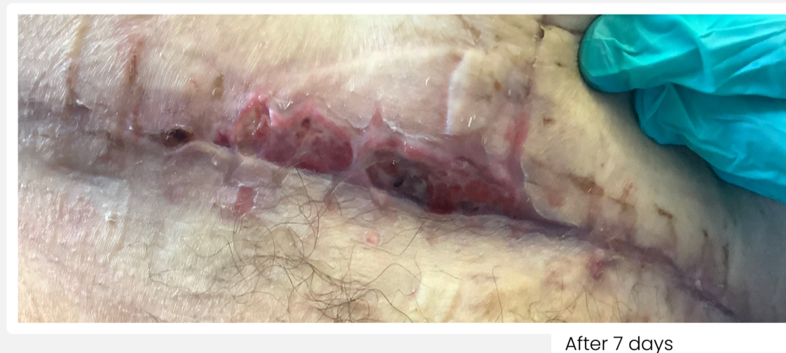
After 7 days