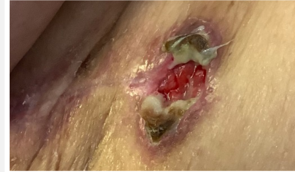
After 7 days