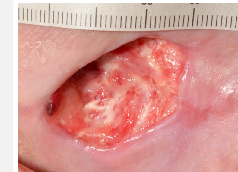
After 14 days