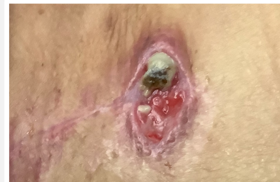
After 14 days