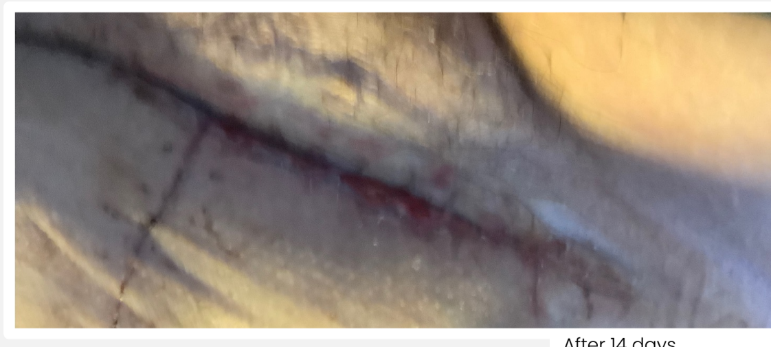
After 14 days