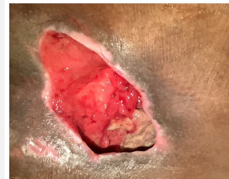
After 14 days