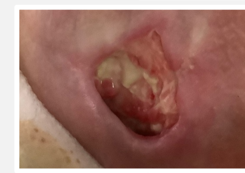
After 7 days